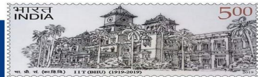
Commemorative stamp on the completion of 100 years of institute released by the Hon'ble PM

It conducts short-term courses, training courses, seminars, workshops and conferences for enrichment in quality of students and entrepreneurs. The department has its own Civil Engineering Society which is dedicated in organising lectures by various experts in their respective field, group discussions, competitions, sports and various other extra-curricular and cultural activities so that there would be an holistic all round development of students. Also this society conducts a separate fest for the Civil Engineering Students, known as, Shilp.